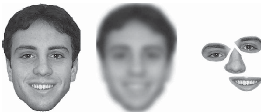
Figure 1. Example stimuli showing an unmanipulated face (left), a blurred face (centre), and displaced features (right).

This experiment used the divided visual field paradigm (see Bourne, 2006). It also follows the same procedure as experiment 1 of Bourne and Hole (2006), but with the addition of the manipulated prime faces. Participants sat in